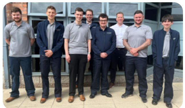
Members of NT Voice & Data's highly commended support team.

NT Voice & Data Solutions are now able to differentiate their Wildix telephony platform, and benefit from an additional monthly recurring revenue stream. NT have deployed the solution to further clients who have opted for subscription plans. In a matter of months, they signed up many other customers.